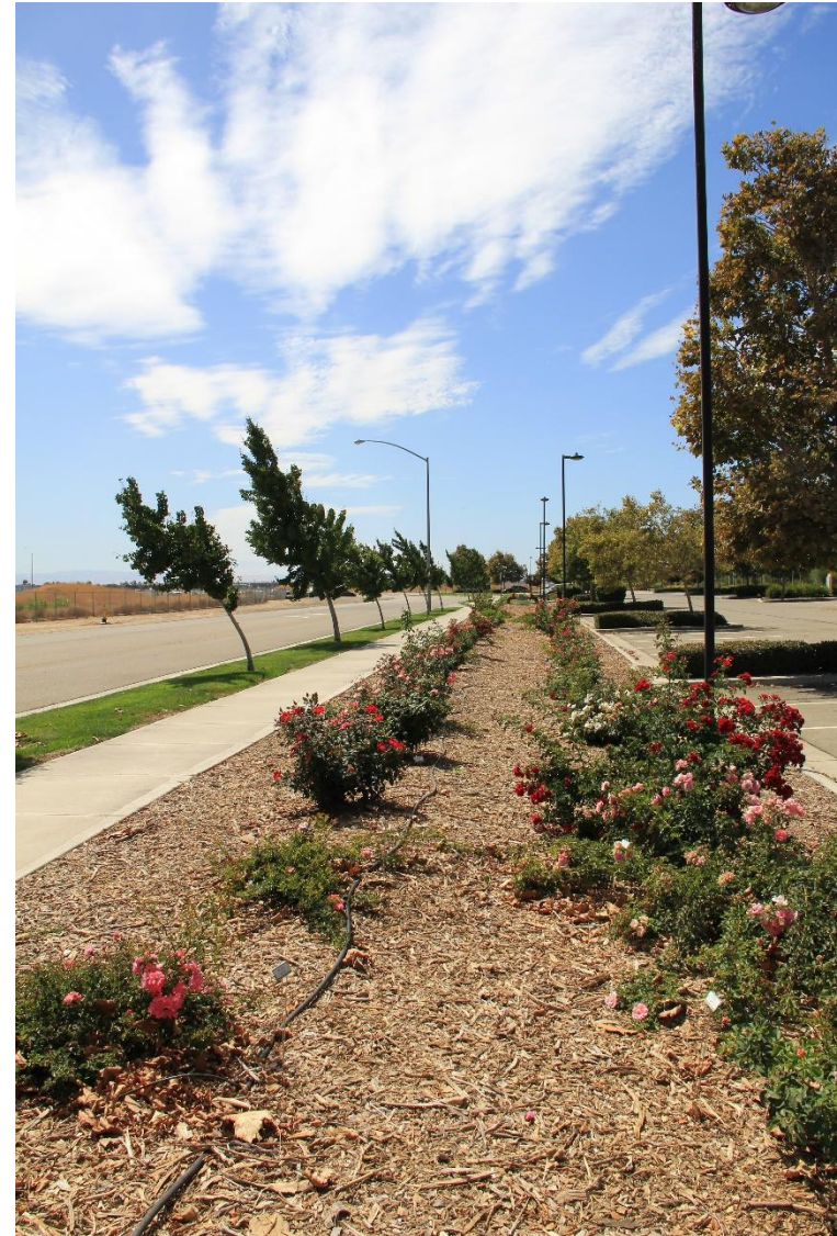
Figure 6. Rose trial Year 1 in mid-September 2018.