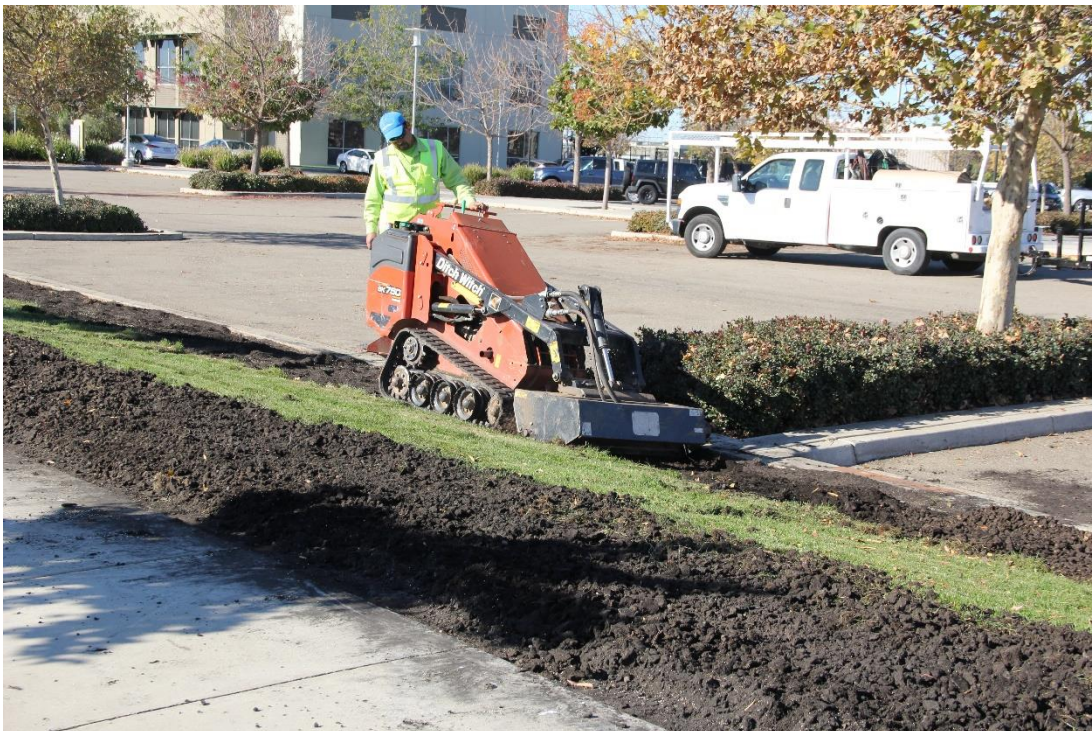
Figure 2. Soil amendments were tilled in thoroughly.