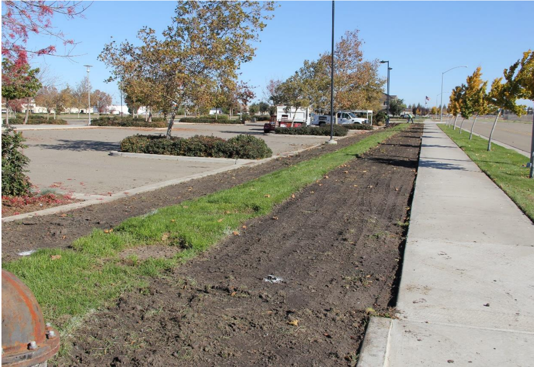
Figure 1. Strips of turfgrass 6' wide were cut out of the turf. The 4' strip down the middle was scalped and subsequently sprayed with glyphosate.