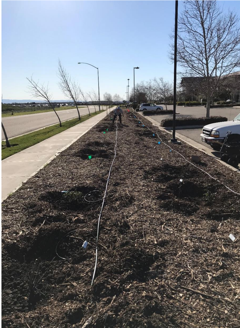
Figure 5. Planting holes being prepared.