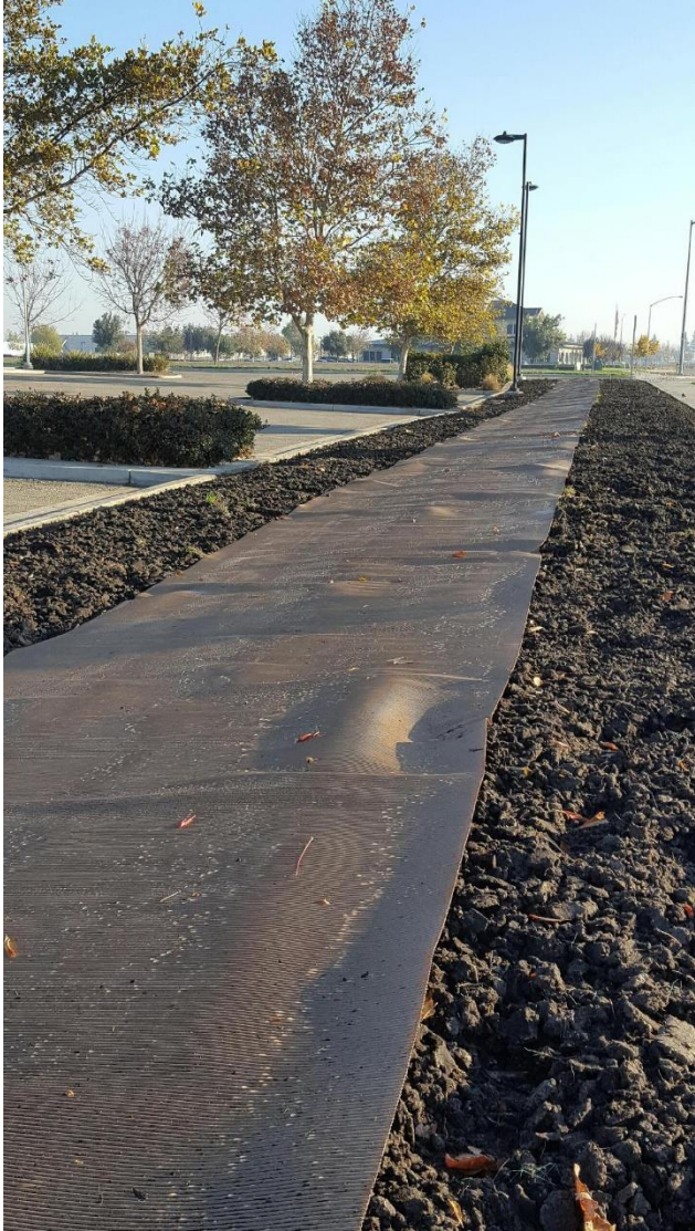
Figure 3. Commercial grade cardboard was laid over the remnants of the turfgrass to create the center path.