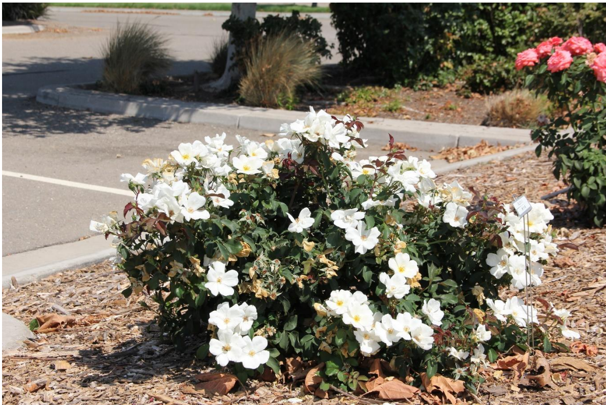
Figures 7 and 8. A couple of great performers so far with clean foliage and abundant blooms in mid-September 2018