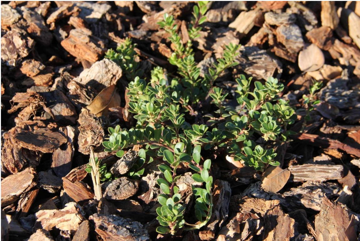
Figure 4. Arctostaphylos 'Wood's Compact' on 50% MAD in Davis in November 2015.