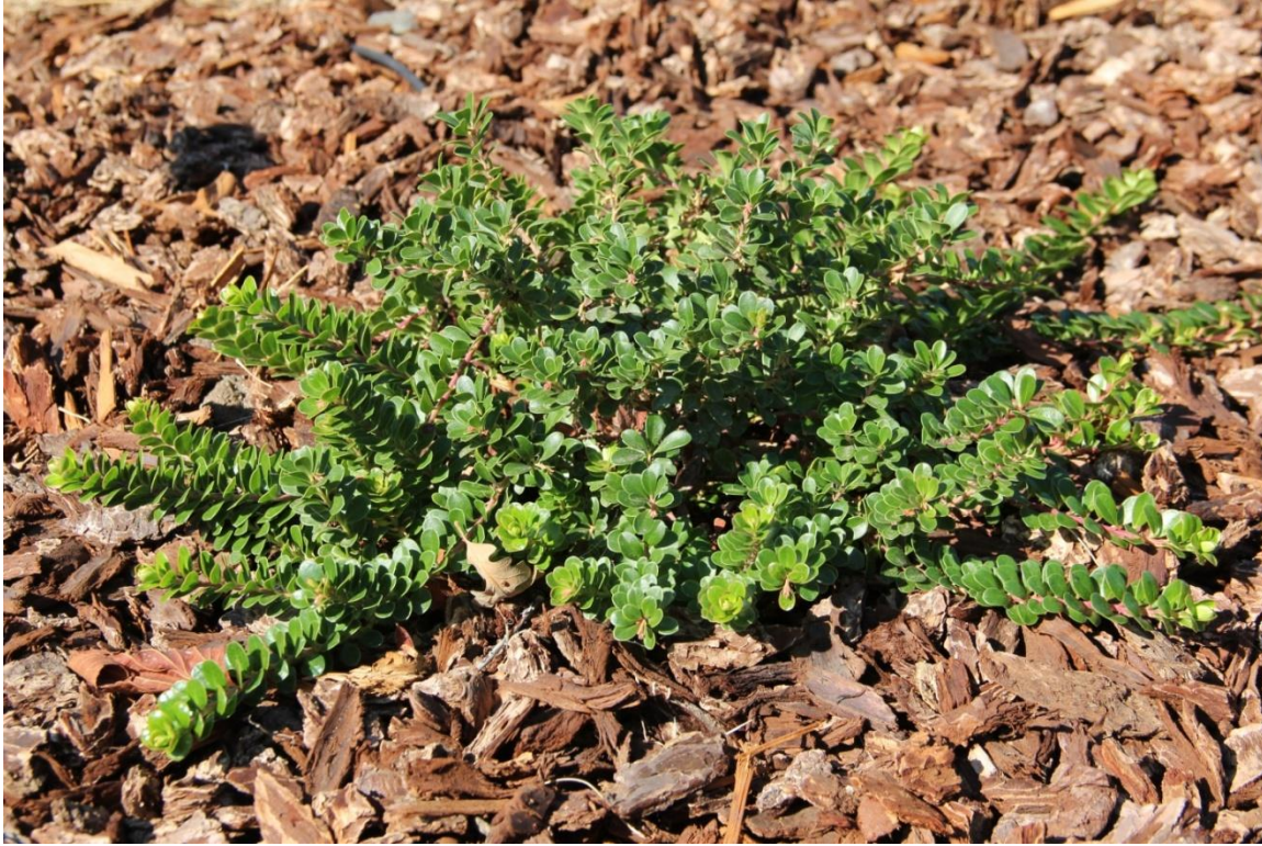
Figure 9. Arctostaphylos 'Wood's Compact' on 50% MAD in Woodbridge in October 2015.