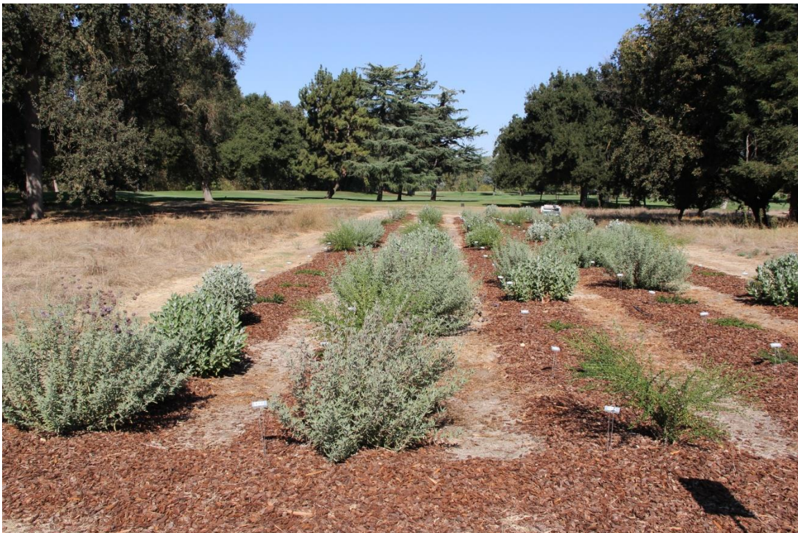
Figure 2. Field 2 in October 2015 on the Woodbridge Country Club golf course.