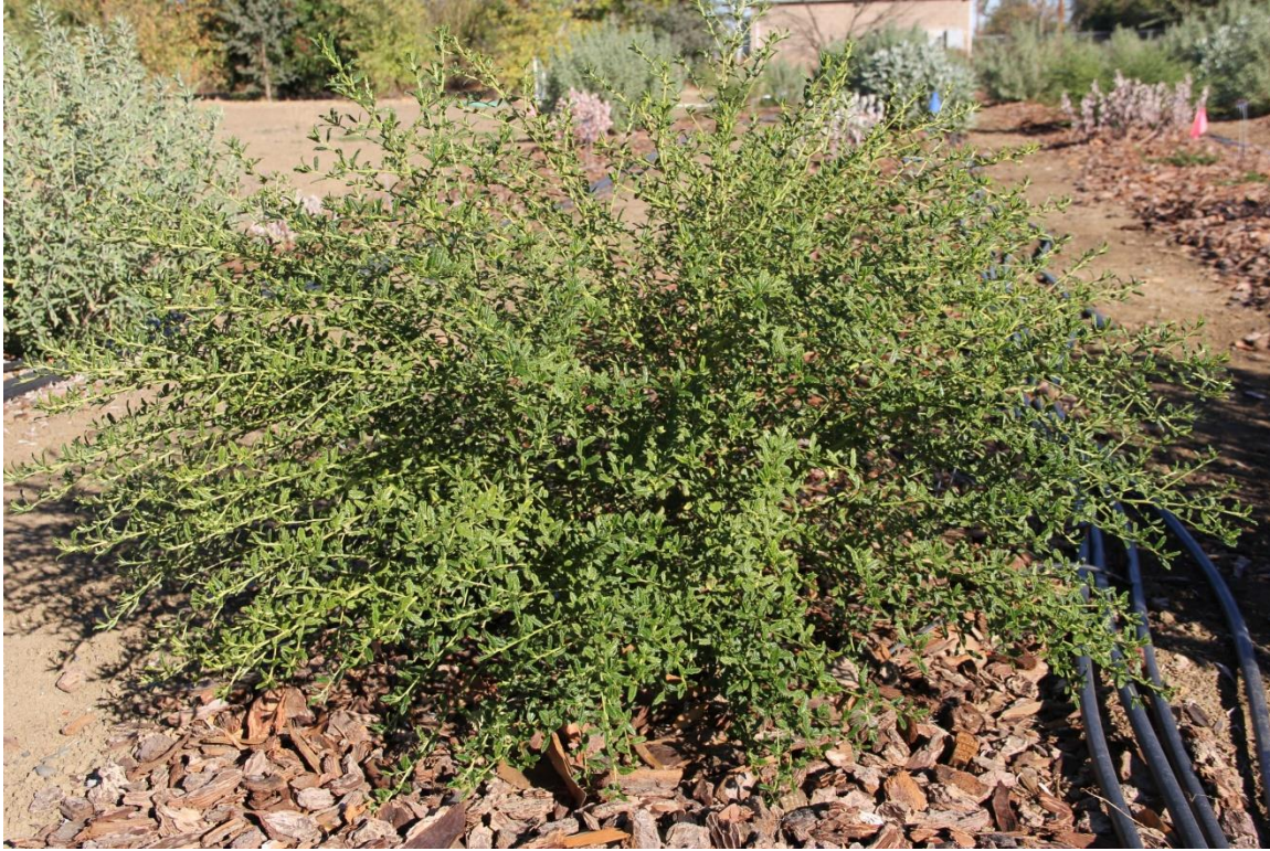
Figure 5. Ceanothus 'Concha' on 50% MAD in Davis in November 2015.