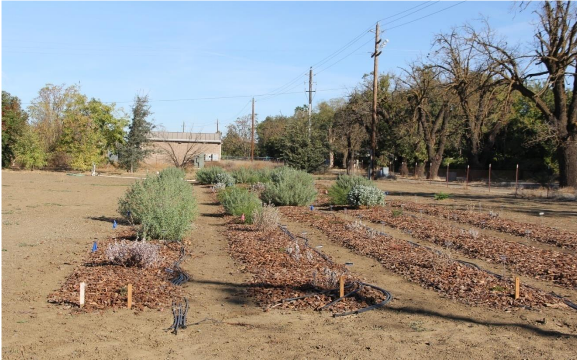
Figure 1. Davis- Field 1 in November 2015 showing the heavy mortality in the south end.