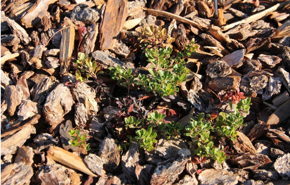
Figure 3. Typical necrosis pattern for Arctostaphylos 'Point Reyes' in Davis.