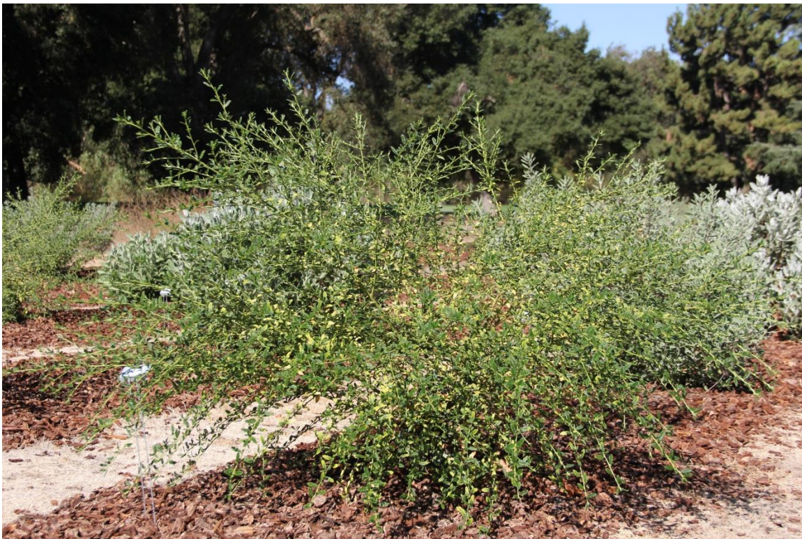
Figure 10. Ceanothus 'Concha' on 100% MAD in Woodbridge in October 2015 showing chlorosis.