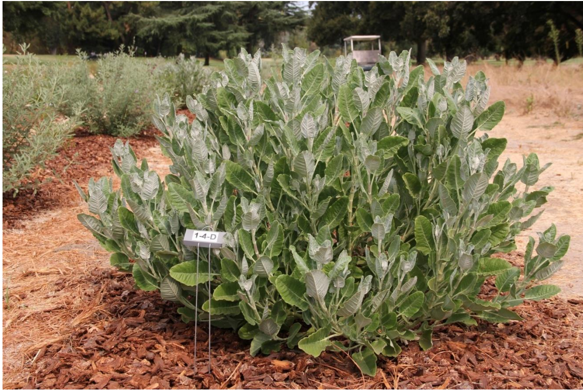
Figure 11. Handsome Eriogonum giganteum on 25% MAD in Woodbridge in Sept. 2015.