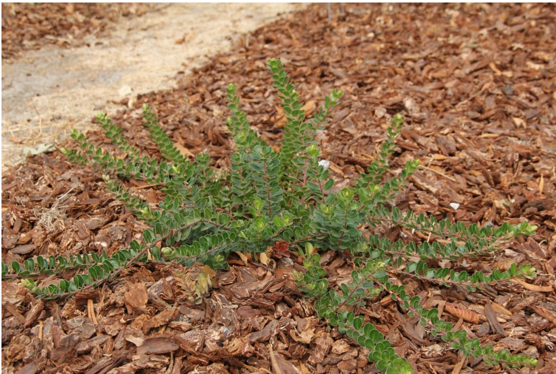
Figure 8. Arctostaphylos 'Point Reyes' on 50% MAD in Woodbridge in September 2015.