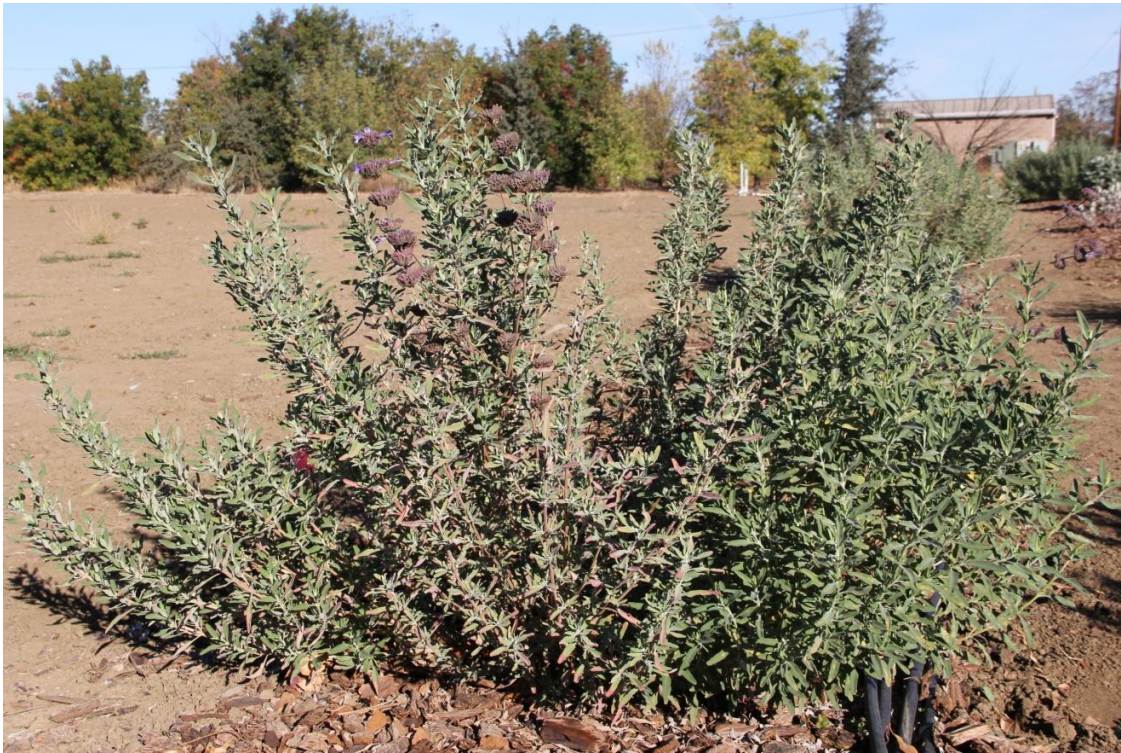
Figure 7. Salvia clevelandii 'Allen Chickering' in Davis on 75% MAD in November 2015.