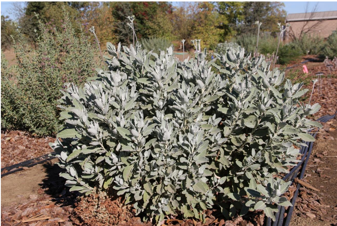
Figure 6. An attractive Eriogonum giganteum in Davis in November 2015.