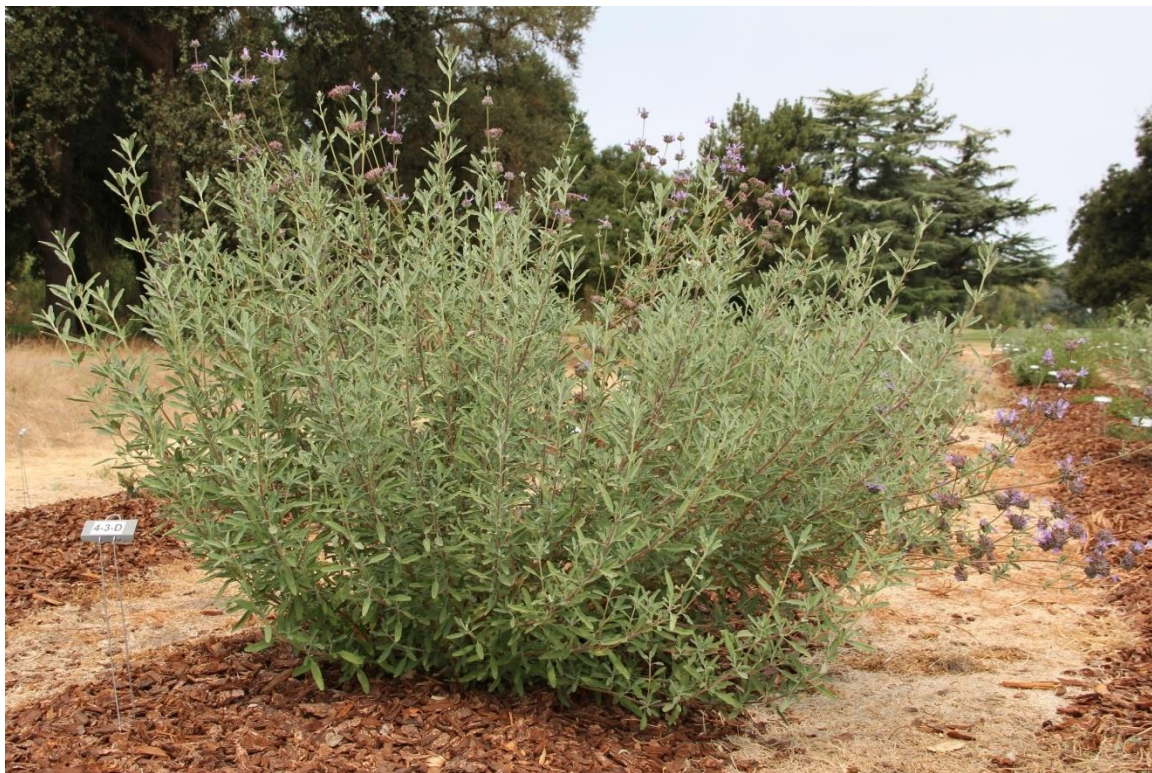
Figure 12. Salvia clevelandii 'Allen Chickering' on 25% MAD in Woodbridge in Sept. 2015.